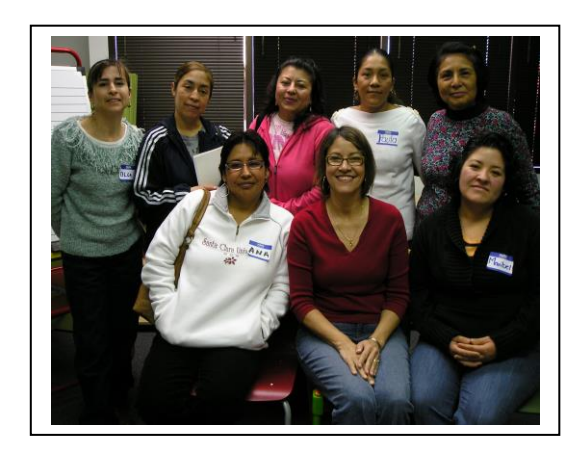
Participants in the Focus group conducted in November 2009